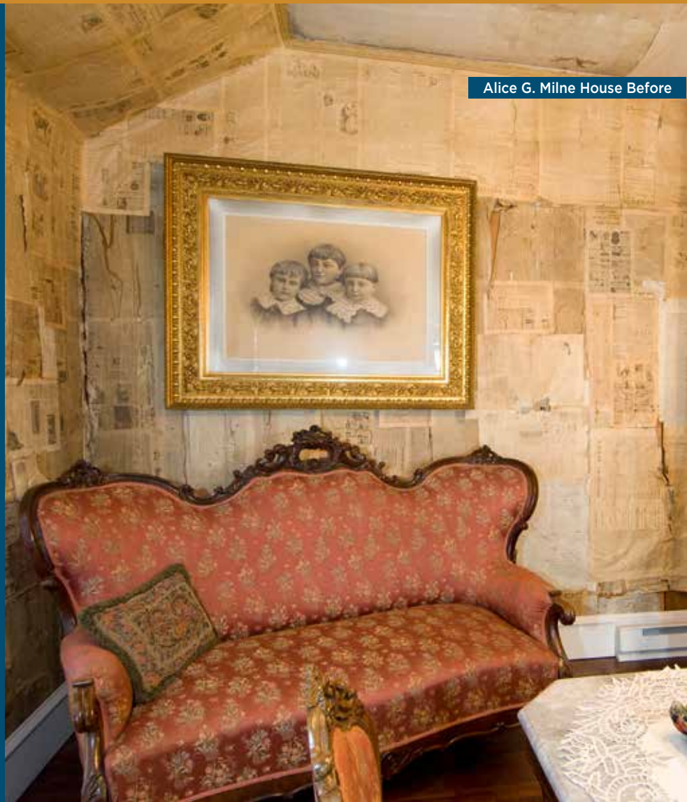
Alice G. Milne House Before

Breckenridge History enhances our community's future by discovering, preserving, and sharing our diverse and extraordinary history.