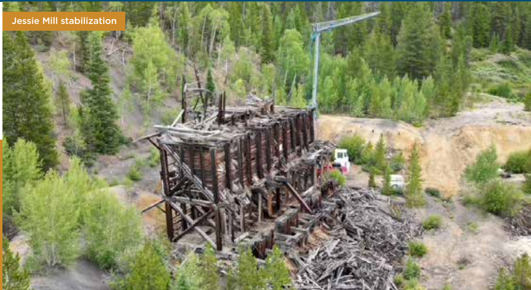
Jessie Mill stabilization

Visit breckhistory.org to learn more about our museums, tours, archives and preservation projects.